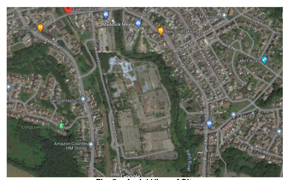
Fig. 5 – Aerial View of Site

Given the significance of redeveloping this brownfield/previously developed site, a development strategy has been progressed. Robust technical studies have been prepared that consider the level of flood risk at the site, the consequences of flooding and mitigation measures to address those risks and consequences. The phasing of the development has been considered with regard to the site enabling and flood works which will be required to be undertaken as part of the CCR funding process.