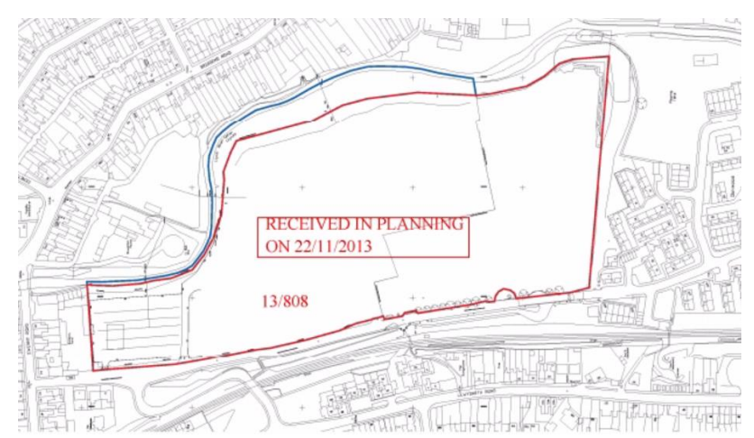
Fig. 1 - Site Location Plan

The development area comprised 4.9 hectares within the freehold ownership of PCMC and 2.75 hectares within the freehold ownership of Bridgend County Borough Council (BCBC).