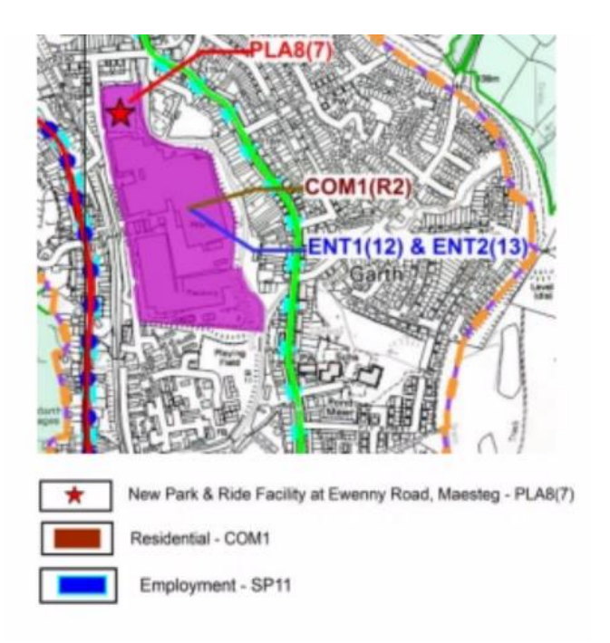
Fig. 8 - Extract from Replacement LDP Proposals Map