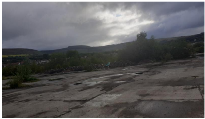
Fig. 7 - Photograph of Site