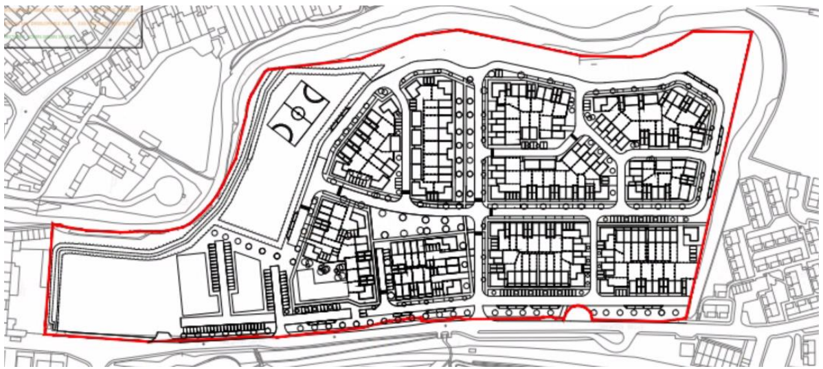
Fig. 4 - Latest Site Location Plan and Masterplan

The revised scheme relates to a proposed mixed use development comprising: residential; employment/enterprise hub, retail, public open space, access, engineering operations, and associated works. The application site is 7.65 Ha in area and is a joint venture between the Council and the main landowner.