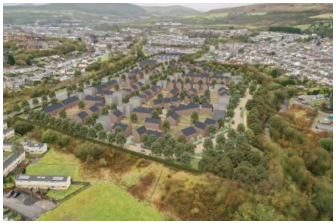
Fig. 10 - Illustrative view of the site from the South

Any future reserved matters application could more carefully address this matter and the Design and Access Statement submitted in support of this current proposal acknowledges that the proposed homes can be located at an appropriate distance away from existing uses and residential properties, and can be orientated side-on to ensure windows of habitable rooms do not directly overlook existing properties. In addition, the established hedgerow that lines the southern boundary will be retained with opportunities to enhance this green buffer with new planting in areas that are less dense.